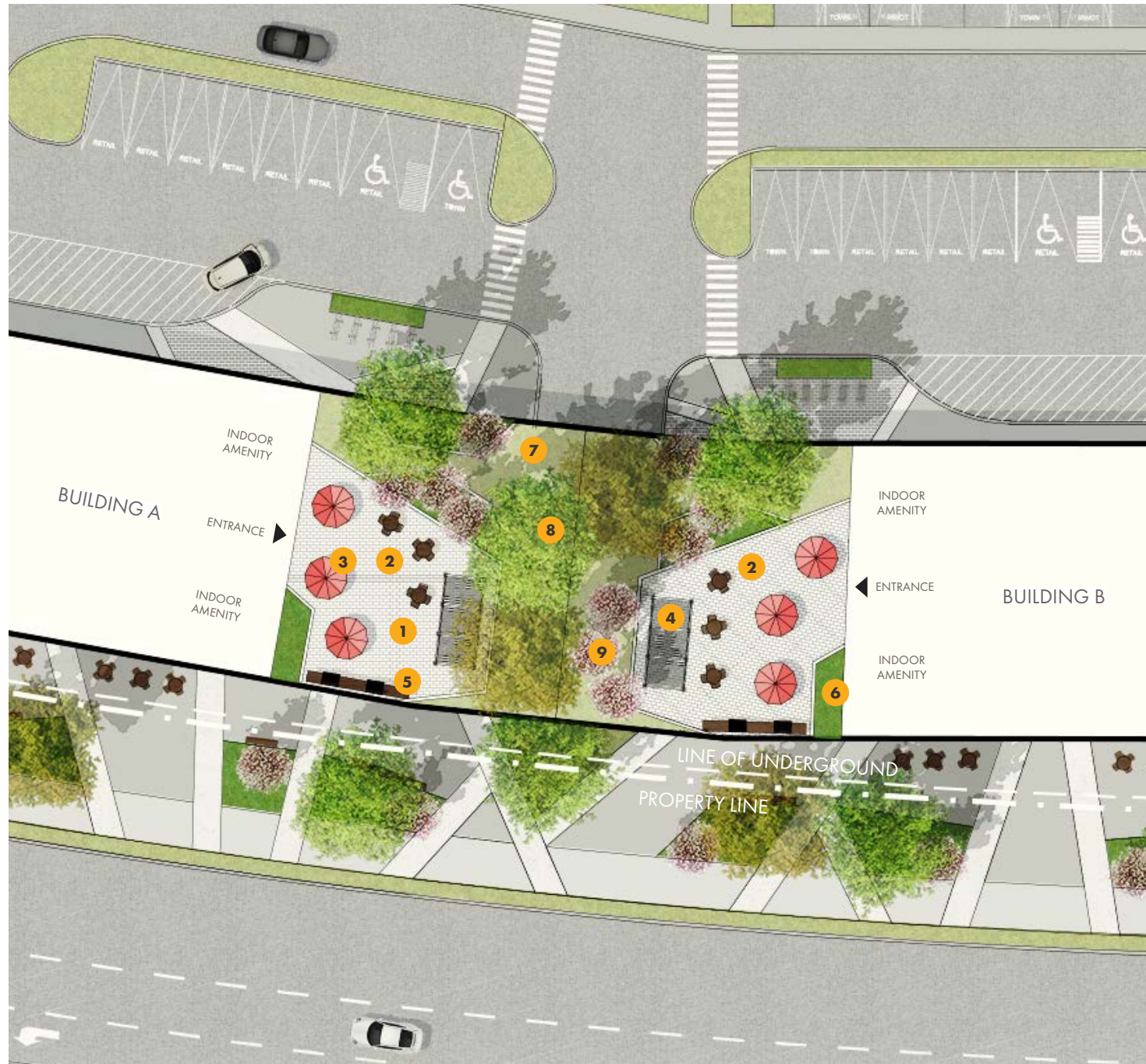
BUILDING A + B - FLOOR 7