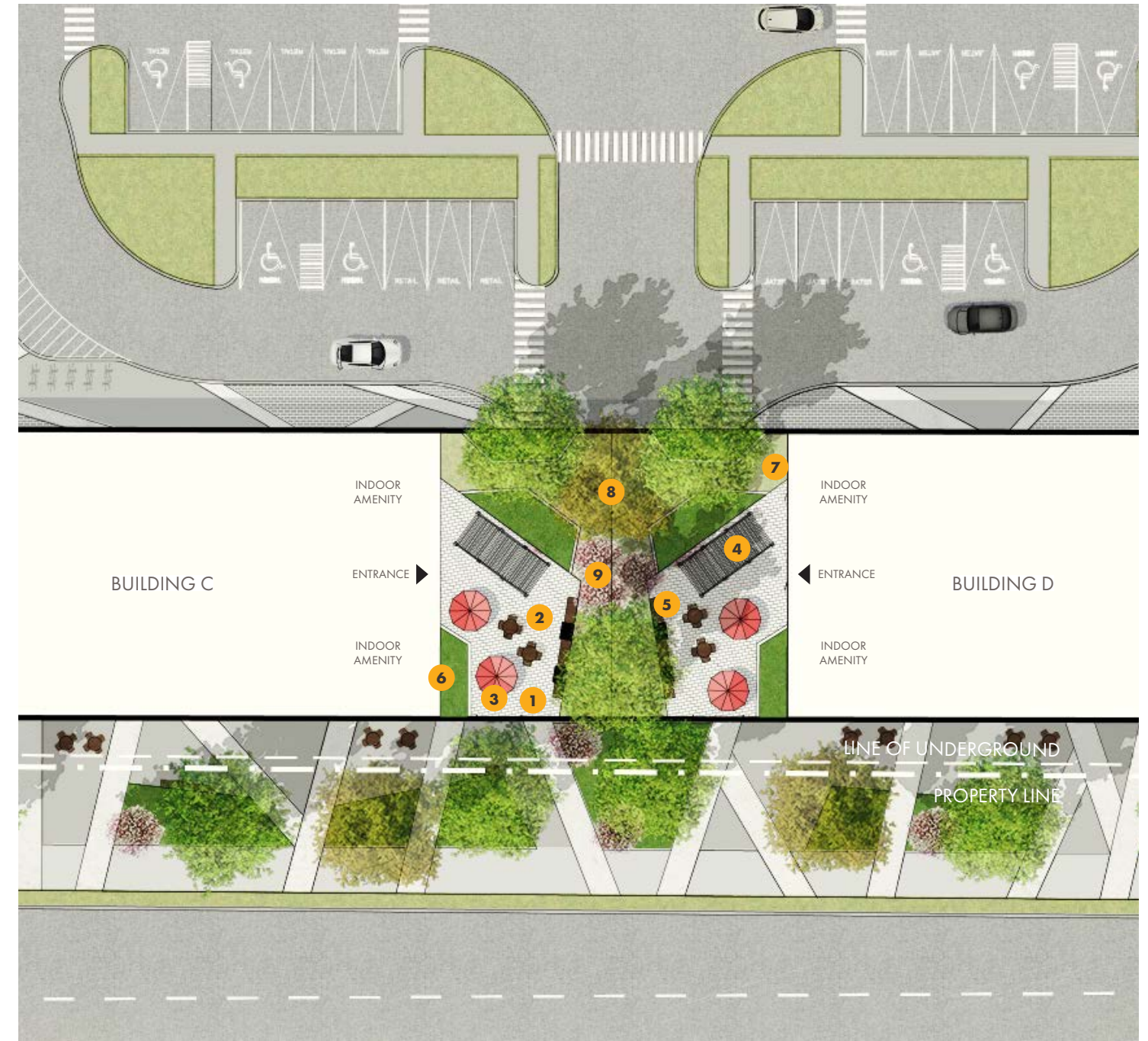
BUILDING C + D - FLOOR 7