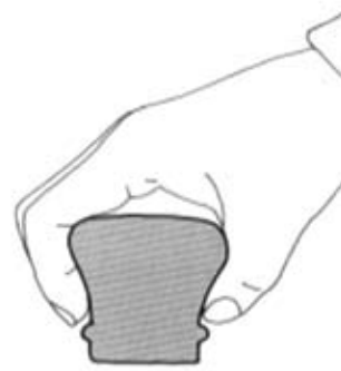
HAND RAIL INEFFECTIVE PINCH GRIP

Diagram Reference: Choosing Wisely: What to Avoid and What to Focus On in Assessing Home Stairways for Fall Prevention/Mitigation. By Jake Pauls, CPE, March 6, 2015